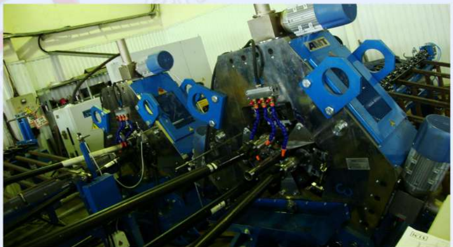
HELICAL ROLLING LINE HRL3020