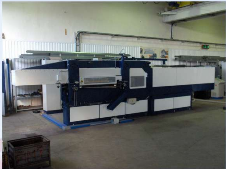
CROSS WEDGE ROLLING LINE WRL3010