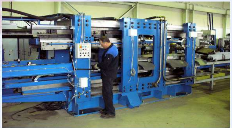
CROSS WEDGE ROLLING LINE WRL10032