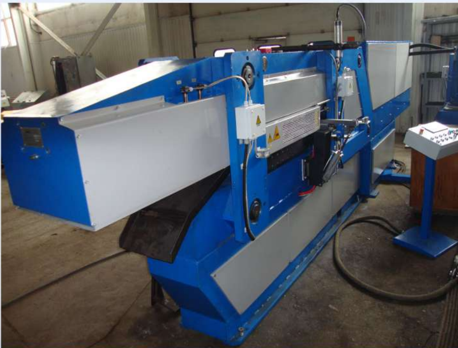
CROSS WEDGE ROLLING LINE WRL3010