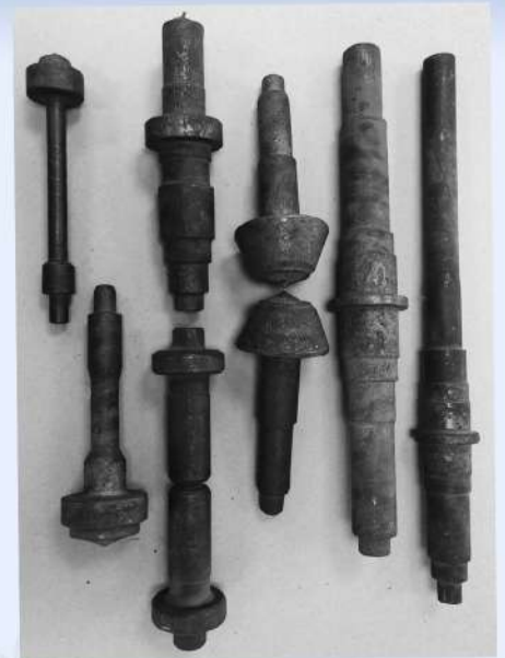
SHAFT & GEAR PREFORMS - TRANSMISSION & FRONT DIFFERENTIAL