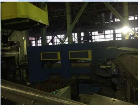
CROSS WEDGE ROLLING LINE WRL10030TS