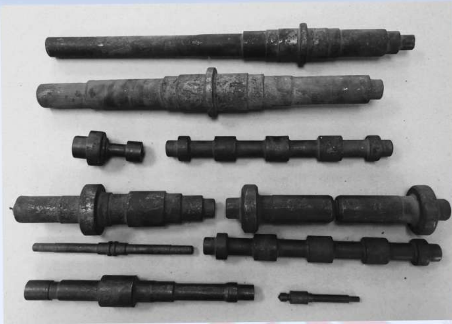
SHAFT & GEAR PREFORMS - TRANSMISSION & FRONT DIFFERENTIAL