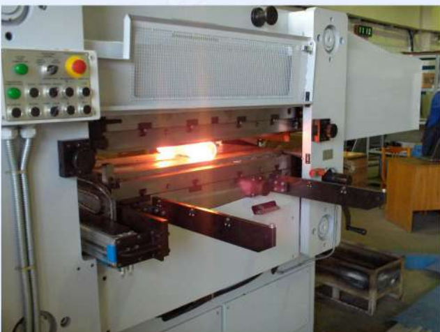
CROSS WEDGE ROLLING LINE WRL8010