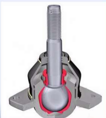
BALL JOINT ASSEMBLY - CONTROL ARM