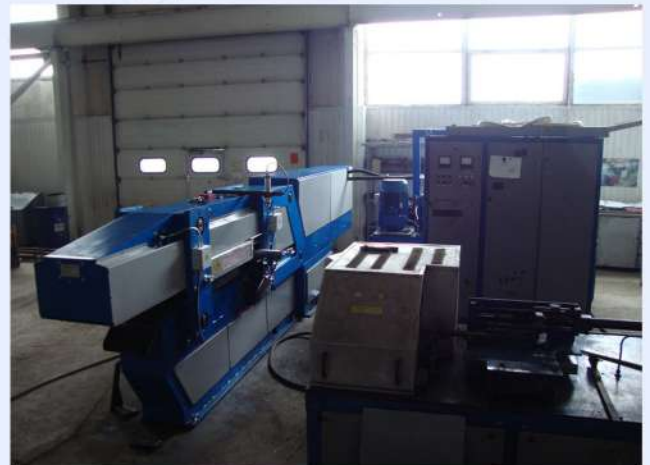
CROSS WEDGE ROLLING LINE WRL6014