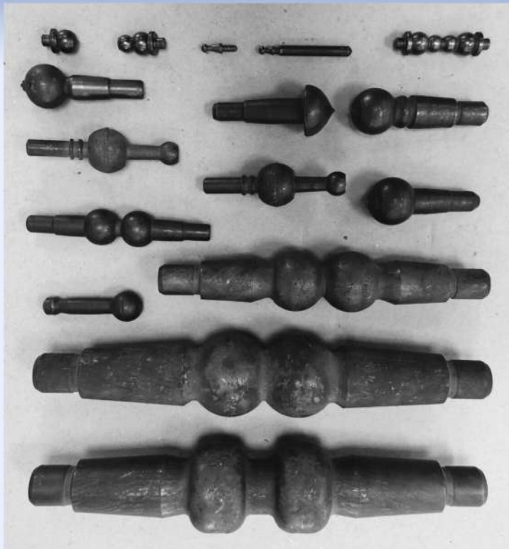
BALL JOINT PREFORMS

CROSS WEDGE ROLLING OF BALL-TYPE PRODUCTS IN COMPARISON WITH COLD HEADING