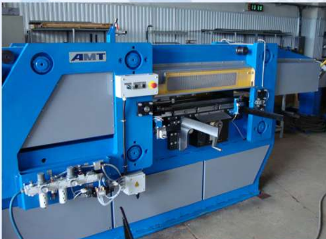
CROSS WEDGE ROLLING LINE WRL8012