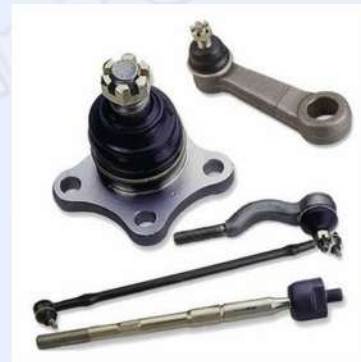
BALL JOINT & LINKS FOR SUSPENSION COMPONENTS